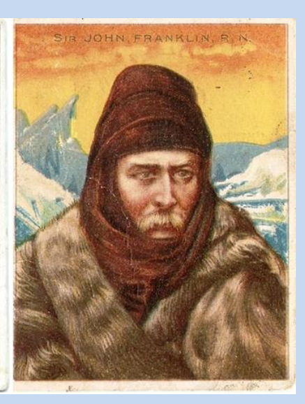
Peary, Shackleton and Franklin