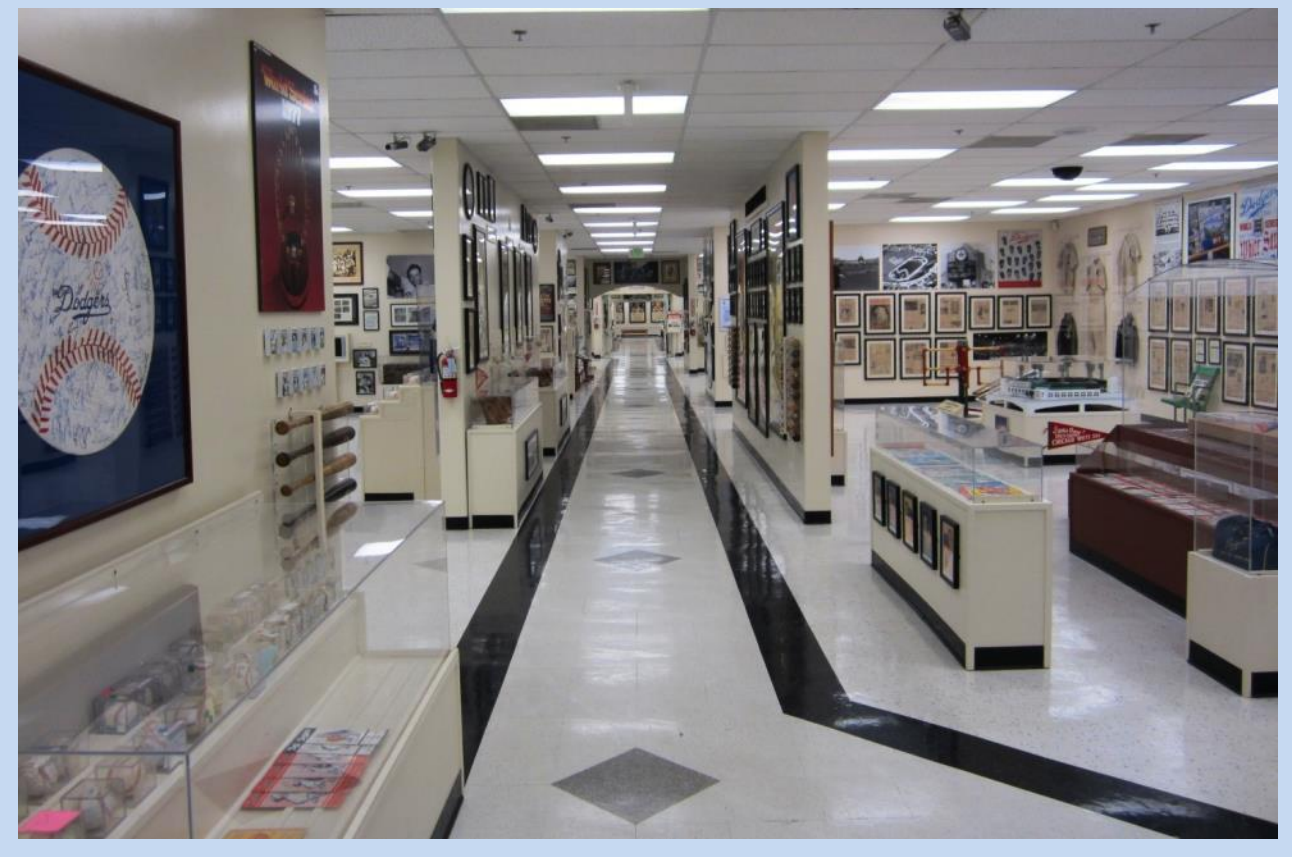
Everything is well-organized and beautifully displayed in this private historical museum of baseball collectibles.

Many items were best appreciated by hanging them on a wall. Other collectors have had the experience of running out of wall space and having spouses who envision other uses of walls than displaying sports memorabilia. Cypres concluded he needed a good-sized building to display his collection, and he happened to already own such a building in Los Angeles. The building is slightly larger than the Basketball Hall of Fame and about 60% as big as the Baseball Hall of Fame. The museum proper is 32,000 square feet, but there is another 14,000 square feet of offices on the second floor decorated with many additional items and providing storage for collectibles not currently on display.