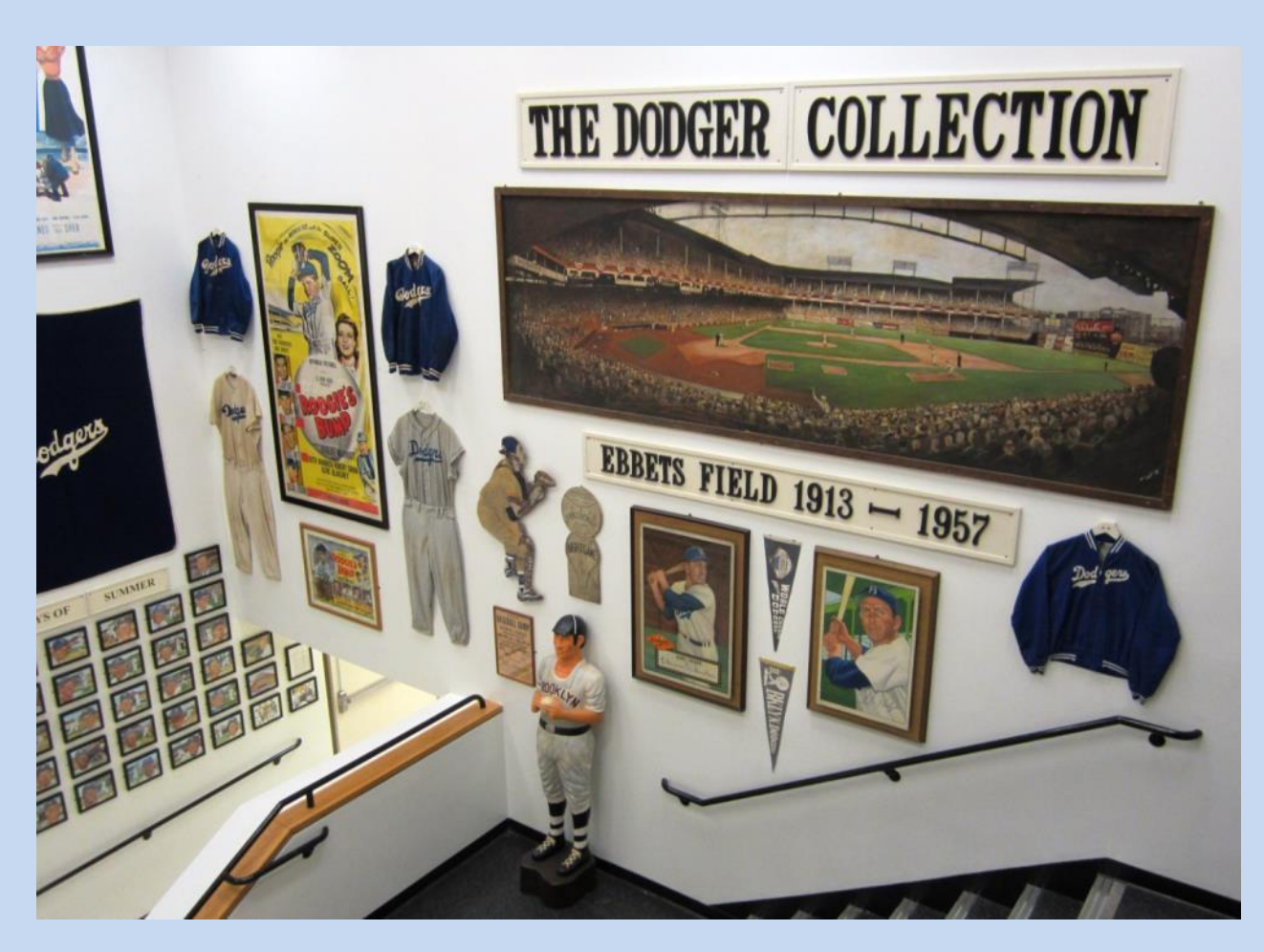
Memorabilia and displays are on every wall.