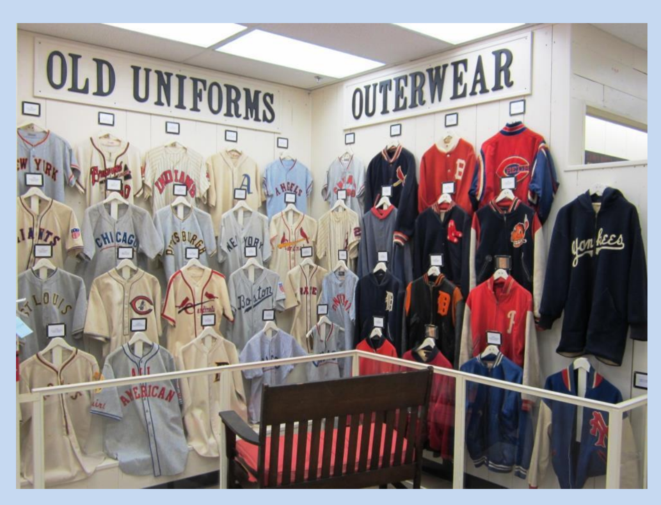
Baseball uniforms and jackets are displayed.