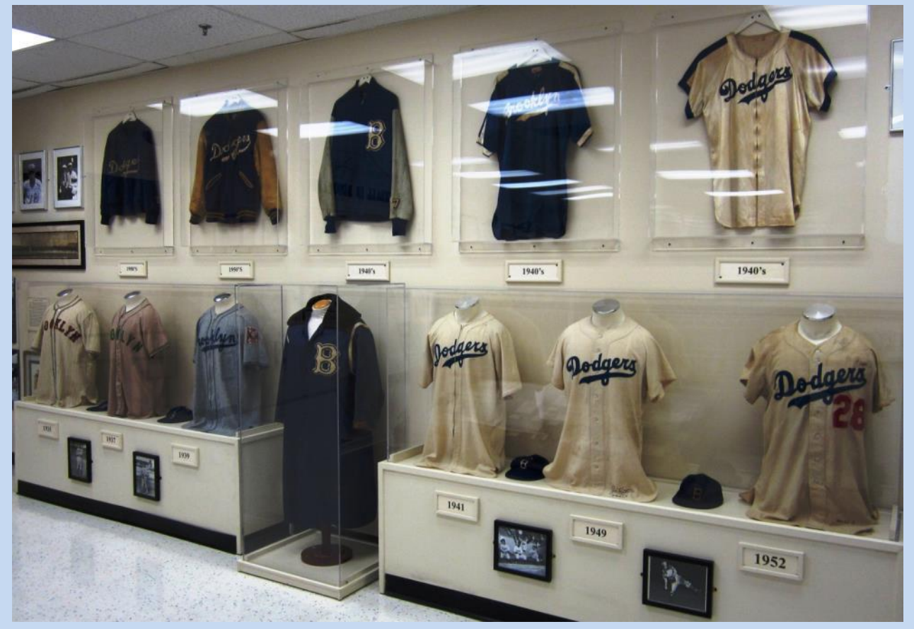
Jerseys and jackets are part of the Dodgers gallery.