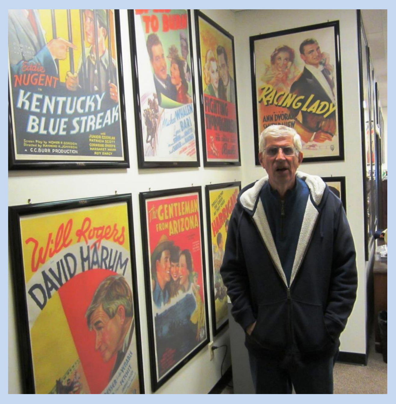
Cypres also collects posters for sports-themed movies.