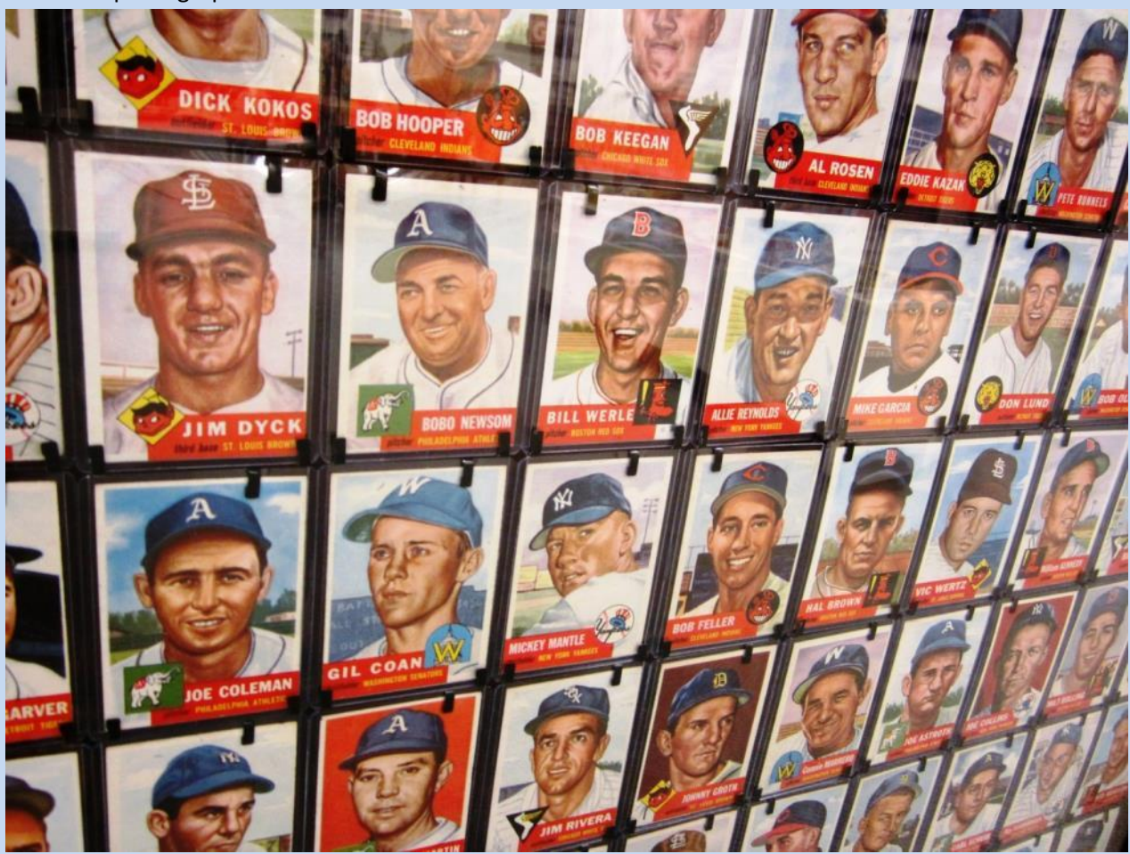
1953 Topps with Mantle in the middle