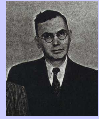
Jefferson Burdick 1953

and isn't as much of a problem to access. If you are just interested in Burdick's collection of Valentines, for example, it is easier to get in the door. The collection is still kept in the binders that Burdick put them in some 50 years ago. The paste is not any moister and problems continue with fragile cards and fragile album pages, but the collection is still available for limited viewing. Any visit has to fit into a window of 2 ½ hours on either Tuesday morning or afternoon. The staff continues to rotate a few hundred cards into the public display on the first floor of the museum.