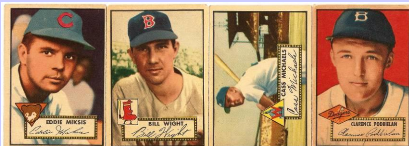
"Higher numbered" 3 rd series gray backs

I talked with a collector who was successful in buying nearly two complete sets of the third series gray backs by just looking at the fronts of cards featured on eBay at "common" prices. The gray backs also have noticeably duller or muted colors on their fronts, apparently different enough that this collector was able to pick them up without paying any premiums before the tulip bulb craze hit.