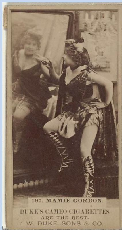
Left: Just one of the 10,000 cards now found online: Cap Anson, (N28),