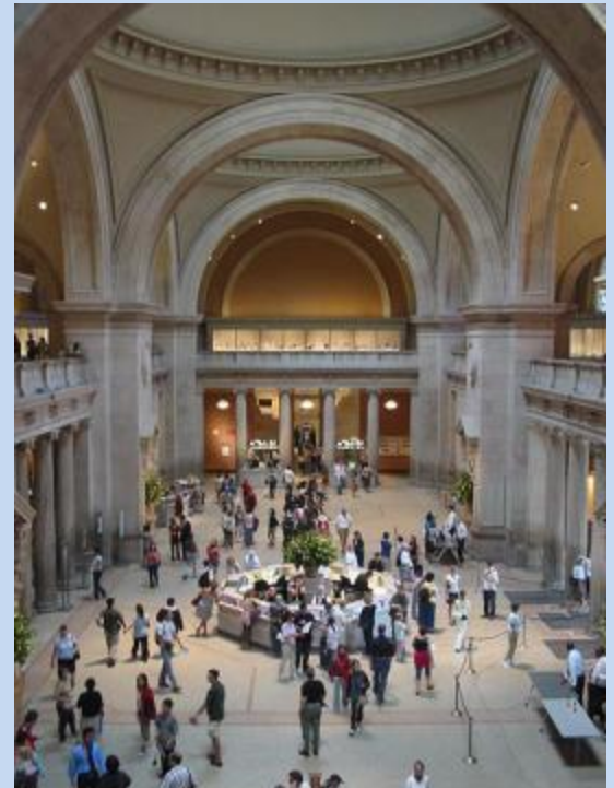
Met Hall