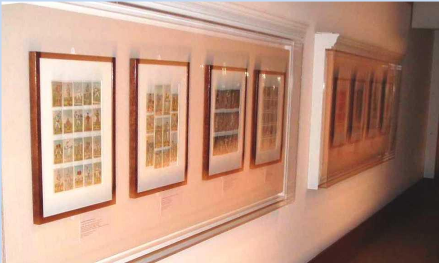
Approximately 150 cards from the Burdick collection are typically rotated into public display in a small hallway.