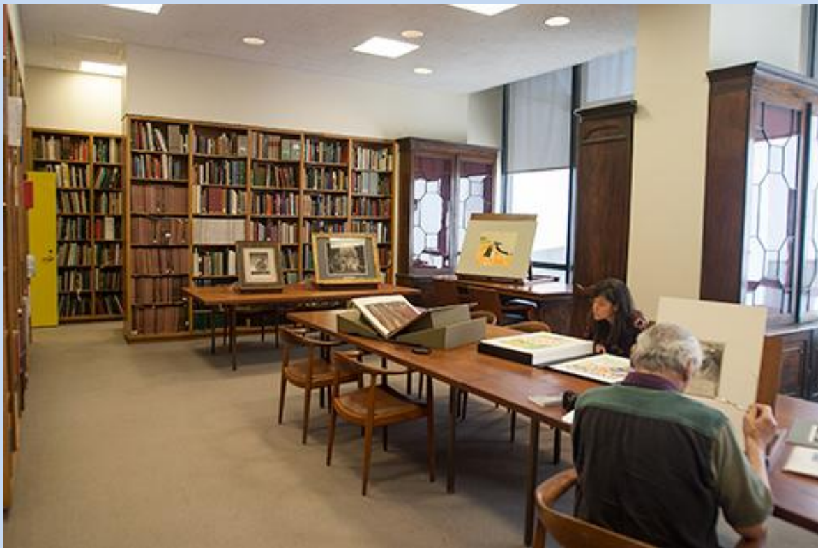
The study room for drawings and prints at the Met

During my own visits in the early 2000s, a museum staffer was there to watch you but not to turn the pages. I notified the staff member if I found a card that was loose or about to become loose – which didn't seem like a very secure situation. Burdick's paste was drying out after 40 years on the job. The museum staff must have reached the same conclusion.